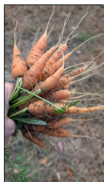
October carrot harvest from Mom's Orchard