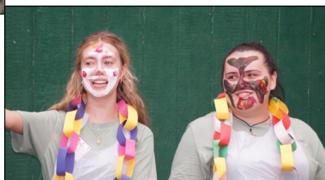
More fancy dress from Arts and Crafts Staff!