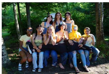
July 4 Minions from Mansfield!