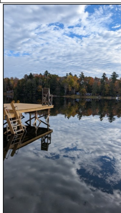
October sky at Burr Pond