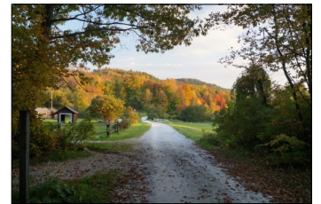
Our way home Recognize this view?

We would say that camp is our “Home” and our friends are a unique and special family! How lucky we are! I will let you know when our staff member submits her work and I am sure we will agree heartily with her feelings!