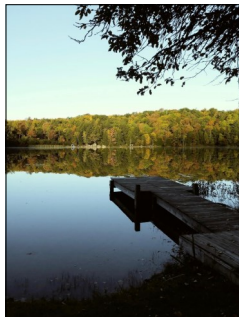
Burr Pond from across the pond

And if I am looking for serenity.....I get down to the pond where blue sky and blue water seem to make the colors of the leaves even brighter. Sitting for an hour there refreshes the spirit for sure!