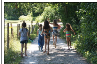
The garden path

Bridge: All that matters is here and now And the orange sun sinking down Gazing up at cotton candy clouds Like little kids again. Like little kids again.