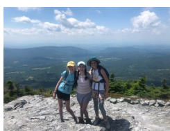
Atop Mt Abe!