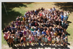
Second Session All Camp Photo