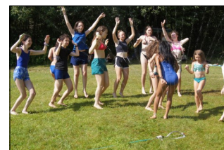
Sprinkler Dance in July